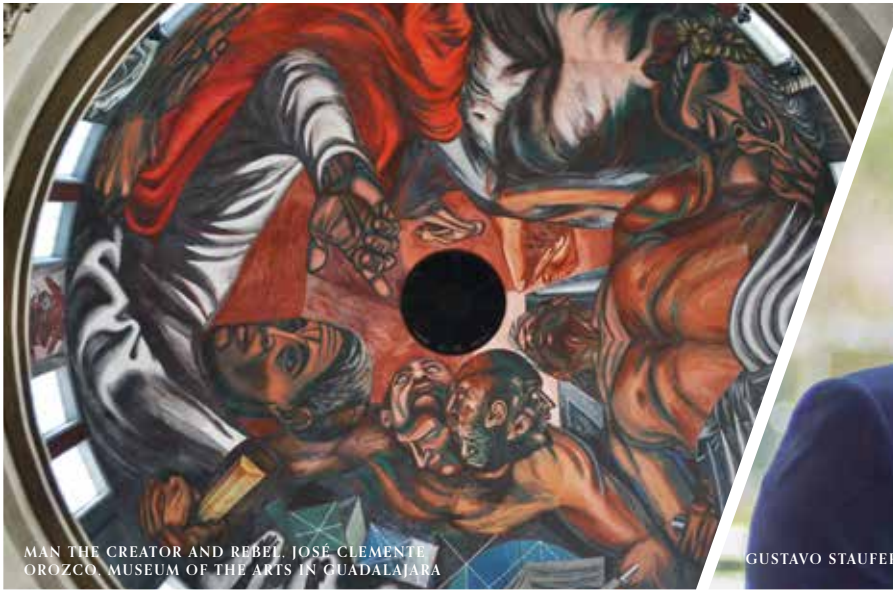
MAN THE CREATOR AND REBEL. JOSÉ CLEMENTE OROZCO. MUSEUM OF THE ARTS IN GUADALAJARA