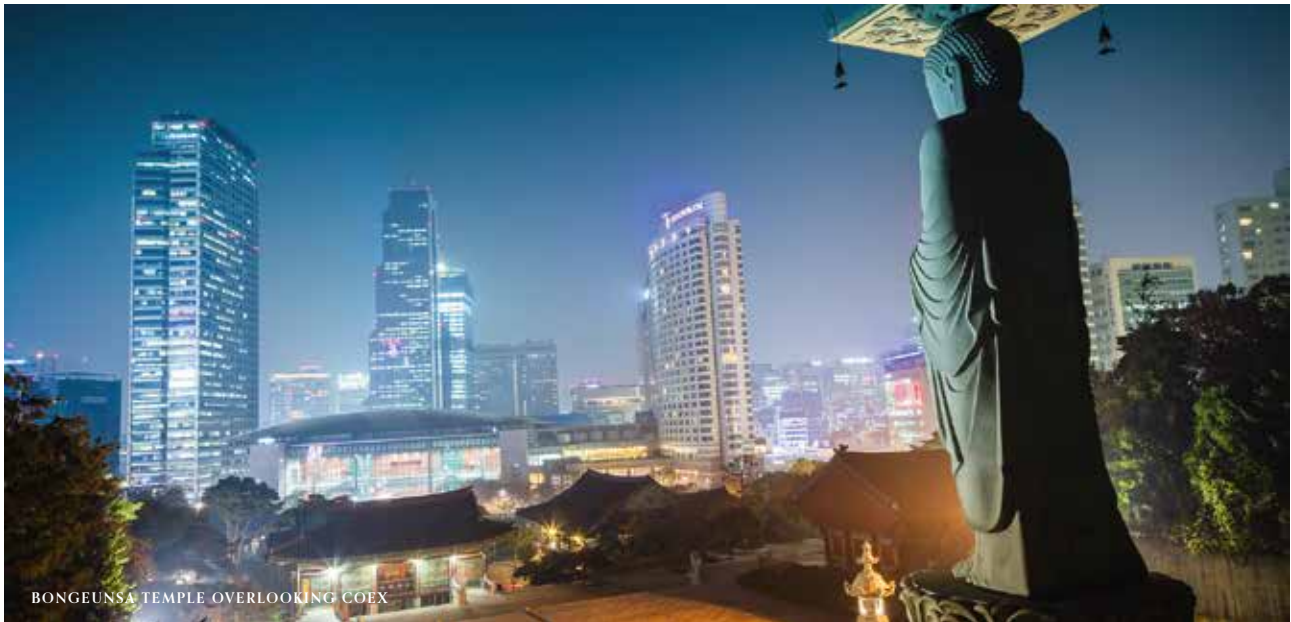
BONGEUNSA TEMPLE OVERLOOKING COEX

of the Korean Society of Ultrasound in Obstetrics and Gynecology (KSUOG). "More so, it is a step forward for KSUOG as it will promote active academic exchanges with overseas medical practitioners and academics, as well as strengthen the knowledge expertise in the domestic region."