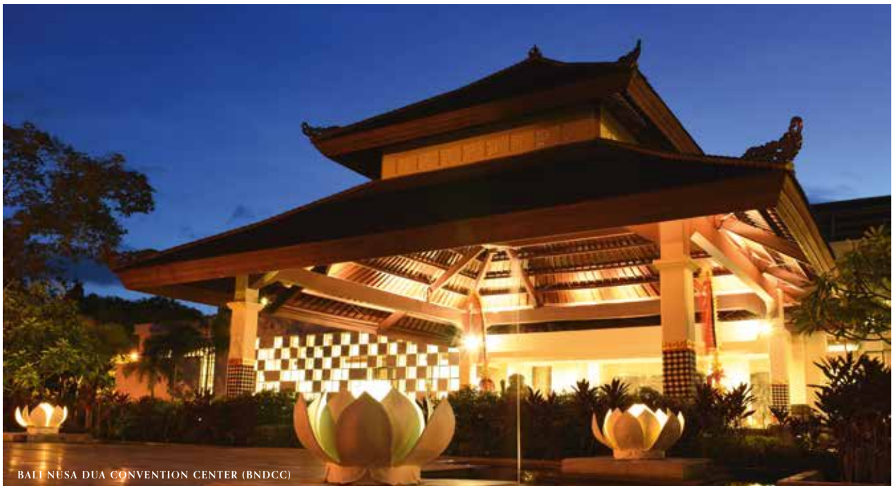
BALI NUSA DUA CONVENTION CENTER (BNDCC)