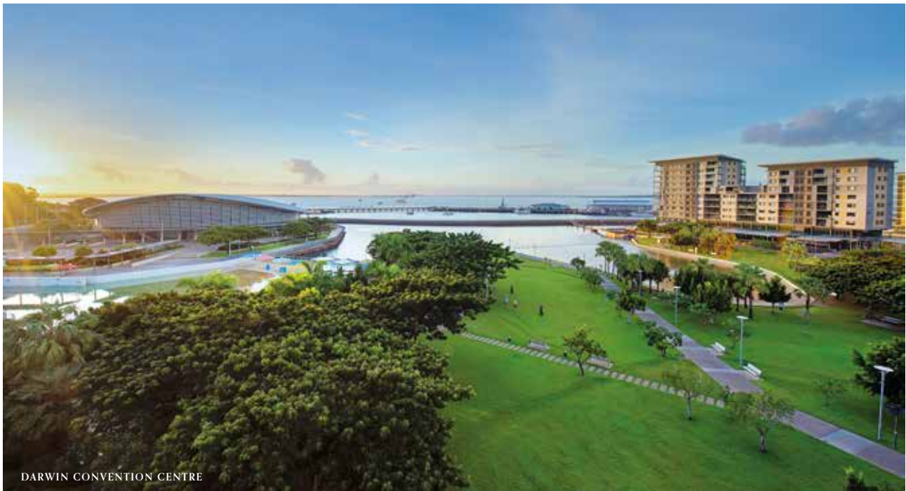
DARWIN CONVENTION CENTRE

The Northern Territory is quintessential Australia: heritage-listed wetlands, wildlife parks, rock domes dating back 500 million years, and the home of national icon Uluru, after all. And while the region is rich in natural resources, it's also a pioneer in agribusiness, international education and remote-area health services. After a day of productive meetings, you'll be in the perfect spot to watch the captivating sunset over the sea right from the capital Darwin, the gateway to Northern Australia.