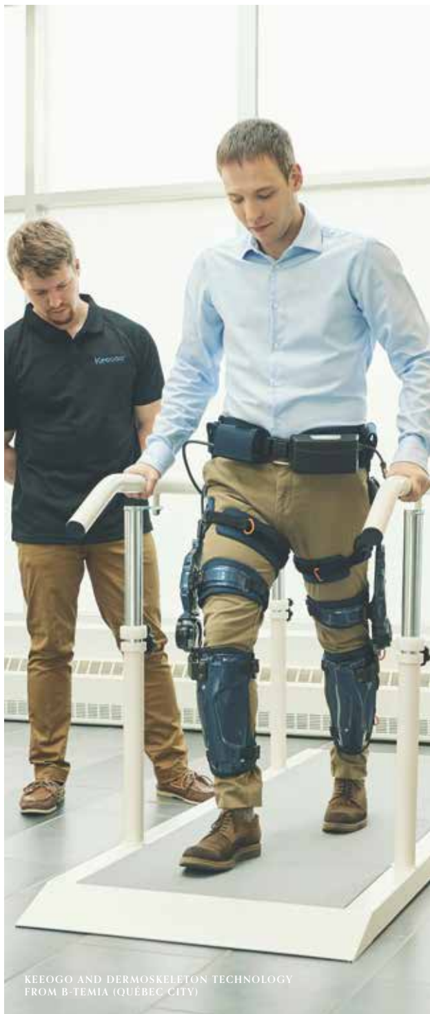
KEEOGO AND DERMOSKELETON TECHNOLOGY FROM B-TEMIA (QUÉBEC CITY)

Keeogo is a Dermoskeleton that helps people with mobility challenges. It allows them to walk without falling, to climb stairs, to pick up and carry objects and to stand with more ease for longer.