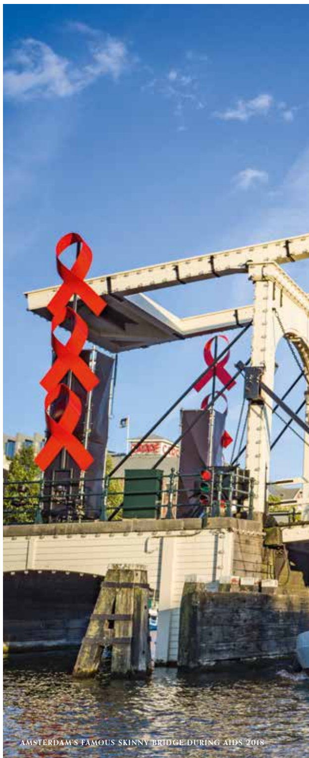
AMSTERDAM'S FAMOUS SKINNY BRIDGE DURING AIDS 2018